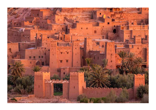
Day 13: 16 April 2026, Marrakech

We begin the day with a scenic drive over the Atlas Mountains to the bustling 'red city' of Marrakech, stopping at the pass for sweeping views over the Marrakech valley and to visit an argan oil co-operative. After checking in to our riad, the rest of the afternoon is free to explore the many souks and the 'Big Square' (Jemaa el Fna) which truly comes alive in the evening when the food vendors, juice sellers, snake charmers, musicians and hawkers are out in force. (B)