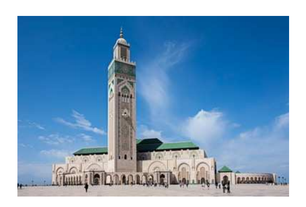
Day 2: 5 April 2026, Casablanca – Rabat

Before leaving Casablanca, we'll visit the stunning Hassan II Mosque, overlooking the Atlantic Ocean. This is one of the largest mosques in the world and the only functioning mosque in Morocco open to non-Muslims. Then it's a short drive north to Rabat, the capital of Morocco. This afternoon, we'll visit the main attractions in Rabat, including the Hassan II tower, the Mausoleum of Mohammed V and the historical Kasbah of the Udayas, with its flower-lined streets and Andalusian Garden. (B)