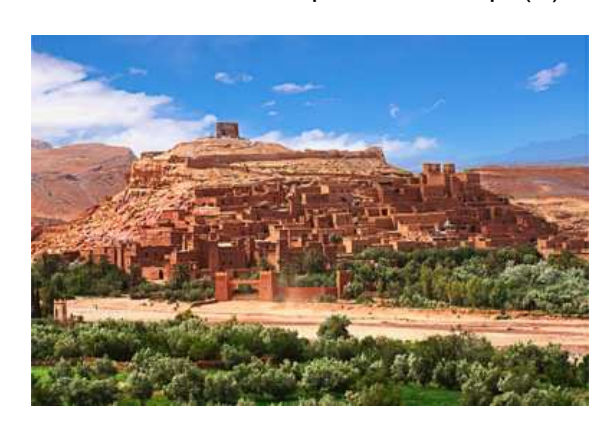
o/n Ait Benhaddou/Ouarzazate

From Skoura, it's just a short drive to Ouarzazate, the film capital of Morocco, where we'll spend the morning and have lunch. Half an hour away, Ait Benhaddou is an 11<sup>th</sup> century Berber ksar (fortified village), UNESCO world heritage site and filming location for many famous movies, including Gladiator and Games of Thrones. Spend the afternoon exploring the kasbah, with its cute shops, artist studios, cafes and viewpoint at the top. (B)