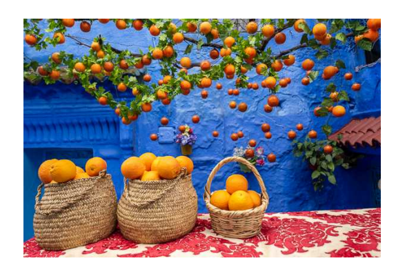
Day 4: 6 April 2026, Chefchaouen

Today is a free day to wander the alleyways, cafes and shops of Chefchaouen medina, Place el Haouta, the main square, the kasbah and several viewpoints above the town. In the evening, enjoy a 30-minute walk to the Spanish mosque outside Chefchaouen (not accessible by road) to watch sunset over the town. (B)