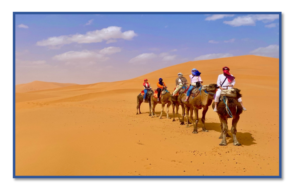
3 – 18 April 2026

Ladies only, small group tour – just four guests 16 days/15 nights