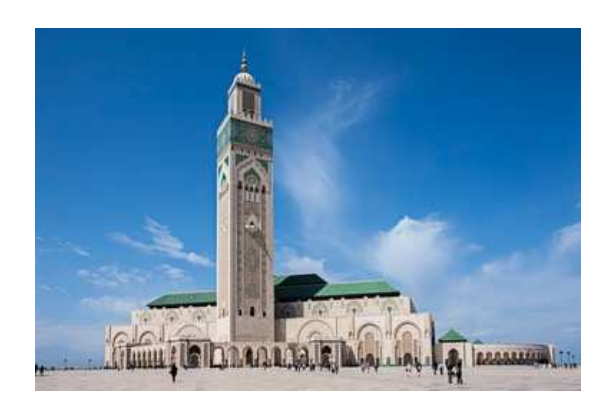
Day 2: 4 April 2026, Casablanca – Rabat

Before leaving Casablanca, we'll visit the stunning Hassan II Mosque, overlooking the Atlantic Ocean. This is one of the largest mosques in the world and the only functioning mosque in Morocco open to non-Muslims. Then it's a short drive north to Rabat, the capital of Morocco.