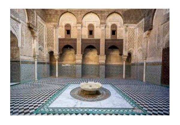
Day 3 - Fes

This morning, we'll begin with architecture photography, photographing a madrasa (religious school) in the medina. We'll aim to be there when it opens and before the crowds arrive. We'll be looking at perspectives, patterns, symmetry, textures and details.