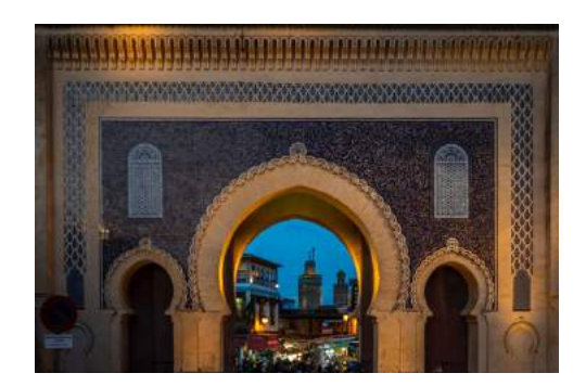
Day 4 - Fes

This morning, we'll begin with another architecture session, again arriving early to beat the crowds, before continuing to the food and spices market. Here, we'll photograph local vendors and the vibrant colours of their fresh produce.