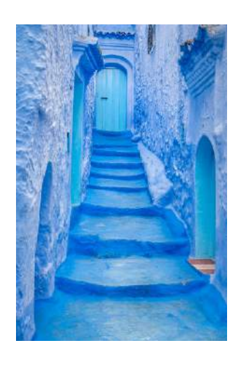
Day 19 – Chefchaouen