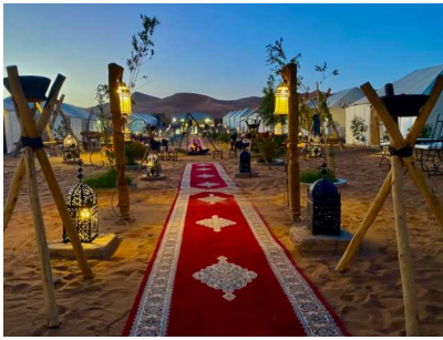
o/n Sahara Luxury Camp

Tonight, after dinner, enjoy a performance of African drumming around the campfire. (B, L, D)