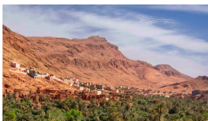
o/n Dades Gorge

Back to Merzouga by camel or 4x4, to meet our transport for the drive along the 'Road of a Thousand Kasbahs.' We'll stop near Jorf to see some centuries-old irrigation systems and in Tinghir to visit a Berber weaving co-operative before continuing to Boumalne Dades. We'll make our way along Dades Gorge, with spectacular views at every turn, to our hotel for the night. (B, D)