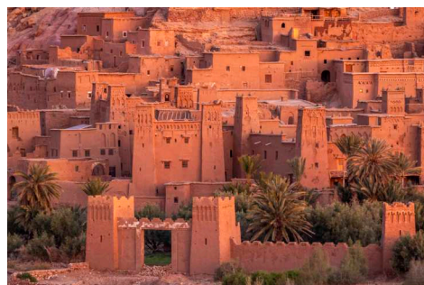
o/n Ait Benhaddou/Ouarzazate

It's just an hour's drive this morning to Ouarzazate and on to Ait Benhaddou, an 11 th century ksar (fortified village), UNESCO World Heritage Site and filming location for many famous movies, including Gladiator and Games of Thrones. We'll spend the afternoon exploring the kasbah, with its cute shops, art studios and cafes and a viewpoint at the top, overlooking the valley and mountains beyond. (B)