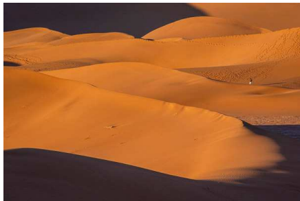
o/n Sahara Luxury Camp

The early risers this morning can watch the sunrise over the vast expanse of Erg Chebbi, the 'Sea of Dunes'. Spend the day relaxing in the camp, walk in the dunes, hire quad bikes or visit an abandoned kohl mining settlement and a family of desert nomads (at extra cost). (B, L, D)